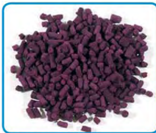
Specially Formulated Potassium Permanganate Granules Absorb Ethylene