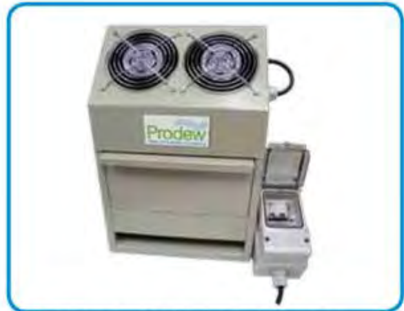
For Post-Harvest and Distribution Center Storage