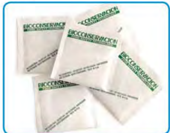
For Use in Produce Cartons