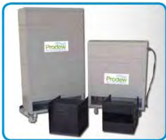
For Post-Harvest and Distribution Center Storage