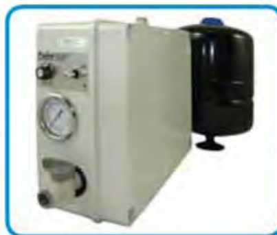
Premium Control Box