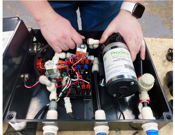
Wide variety of replacement parts always in stock.