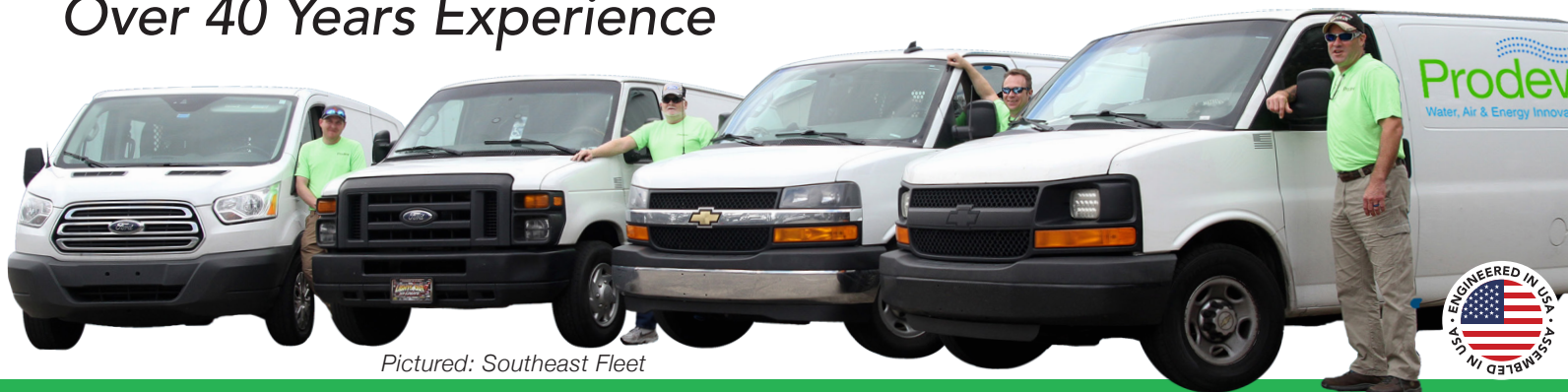
Pictured: Southeast Fleet